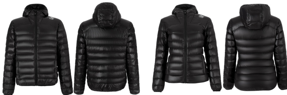
LIGHT PUFFY JKT UX & WO'S 22

Light, windproof, and breathable down jacket with protective hood. High quality 90/10 goose down filling. Two hand pockets with zippers. Elastic bindings in cuffs and hem. Rather tight fit.