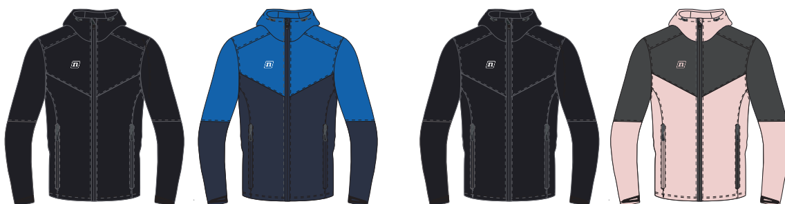
CAMP JACKET UX & WO'S 23

Wind- and water resistant (8000/3000) outdoor jacket in lightweight shell fabric with breathable mesh lining. Adjustable hood with reinforced peak. Preshaped sleeves and adjustable cuffs for increased comfort. Several reflective prints for safety and visibility in the dark. Rather tight fit.