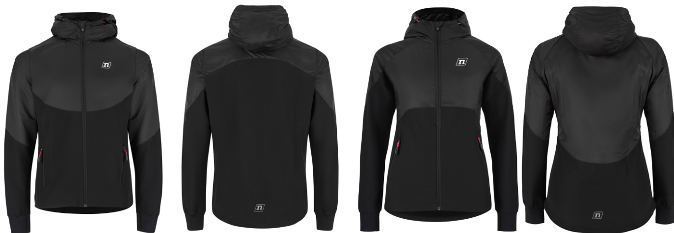
WINDRUNNER JKT UX & WO'S 22

Modern and versatile jacket designed to handle windy and chilly conditions thanks to a combination of windproof fabric and elastic panels. Adjustable hood and elastic cuffs with holes for the thumbs. Two hand pockets with string pullers for easy access. Reflector on the back for safe training in low light conditions.